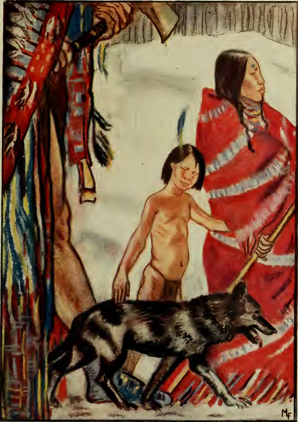
THE GIANT FROWNING ANGRILY, THE WOMAN CARRY- ING THE STICK AND THE BOY LEADING THE DOG